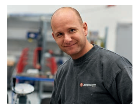
Quick help is essential. Not least for accidents that affect the eyes, where every second counts.